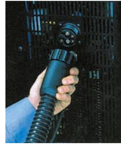
▲ Quick disconnect torch assembly.